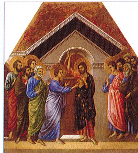
The Maesta Altarpiece: The Incredulity of St Thomas (1461), by Duccio

In the words of the Jubilee prayer: "May the grace of the Jubilee reawaken in us, Pilgrims of Hope, a yearning for the treasures of heaven".