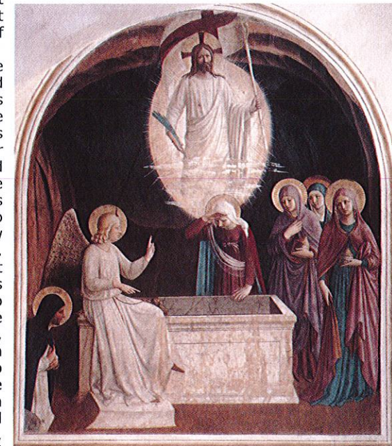
Resurrection of Christ and women at the tomb by Fra Angelico

The Feast of the Resurrection, we said, is the fulfilment of every human hope. It is the guarantee that death is not and never will be the last word. God raised his Beloved Son to life, and God raises us, too, in Him. If the resurrection is the fulfilment of hope, it is also the source of our ongoing hope as we continue the pilgrimage of life. It inspires the blossoming of love in marriage, it empowers the sacrifice of love in humble service of others, it heals the wounds of love from broken relationships, and it smooths the paths of love in working for peace in a fractured world. Resurrection is for which we hope (future), and through which we hope (present). Happy Easter!