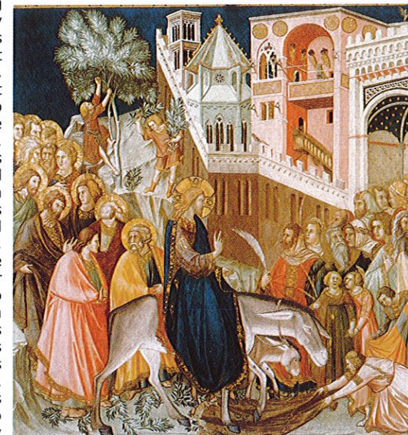
Christ's entry into Jerusalem, Pietro Lorenzetti, Basilica of San Francesco d'Assisi

The ultimate pilgrimage of a Christian is to participate in this. As St Andrew of Crete says, let us go to meet Christ where his final journey begins, in Bethany. To accompany