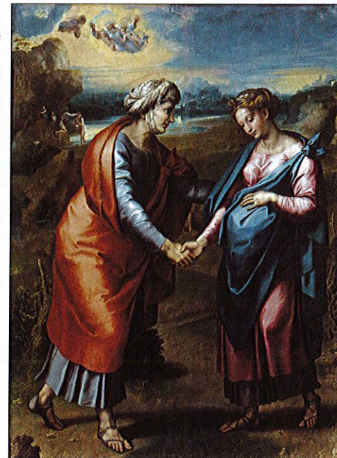
The Visitation, by Raphael, 1517

What Mary next proclaims is perhaps more familiar as we know from Matthew 25 on the hungry, thirsty, naked, sick etc.: "He fills the starving with good things". But how does God do that? As St Teresa of Avila said, and as St Teresa of Kolkata did, "God has no hands but yours, no feet but yours...". We are the presence of the Risen Christ now. We can say without fear, as all our recent popes have done, and as Pope Leo XIV is not afraid to do, that in the present world order, the rich get richer and the poor get poorer. We pray with Mary, that God, "remembering his mercy", and through our generosity, will "raise up the lowly".